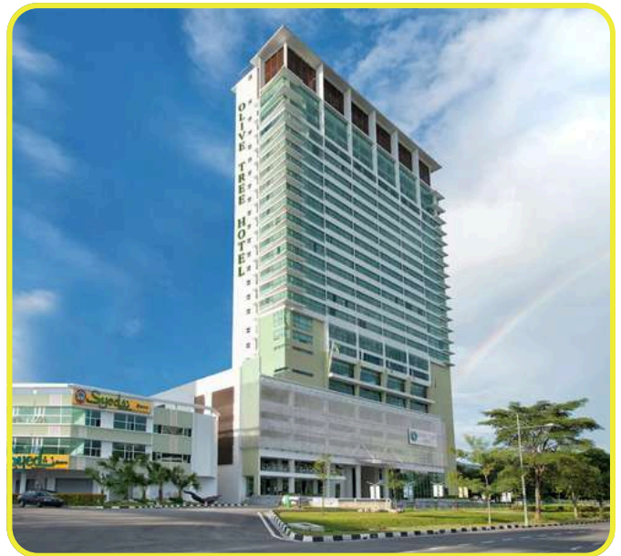
Olive Tree Hotel Penang