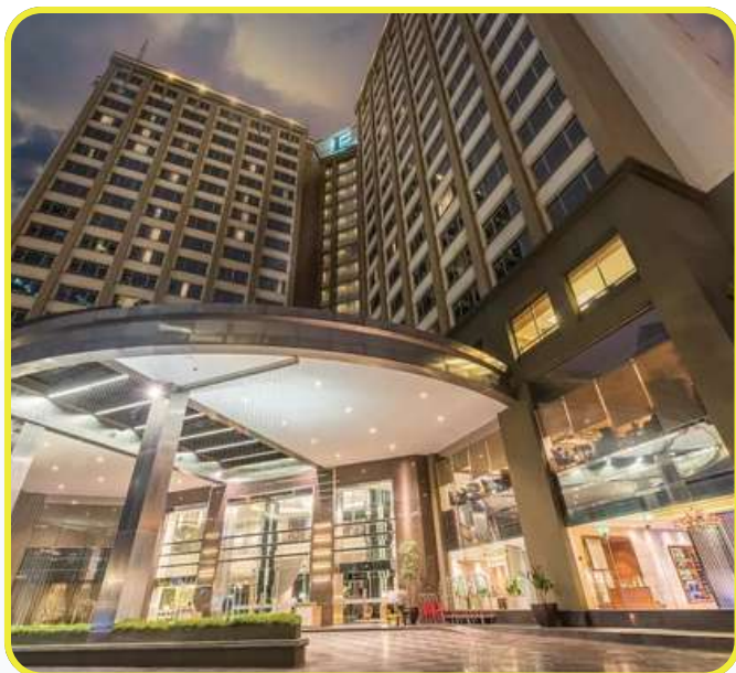
Eastin Hotel Penang