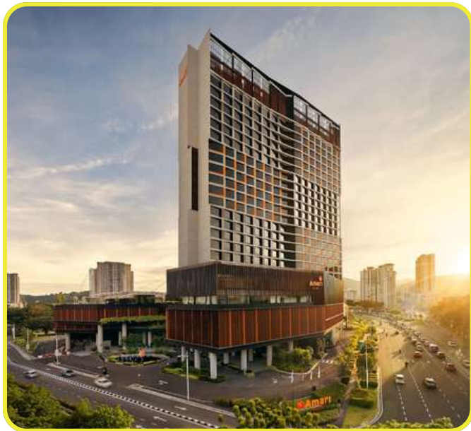
Amari SPICE Penang