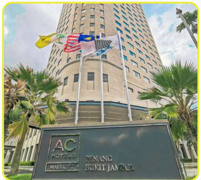
AC Hotel Penang